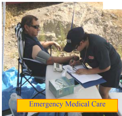
Emergency Medical Care