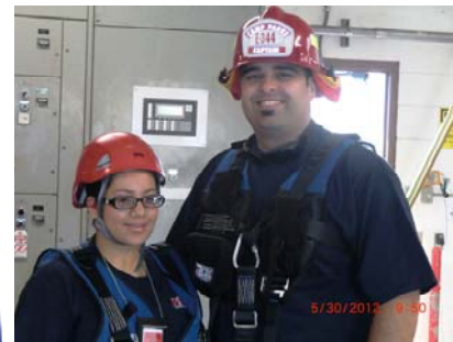
Confined Space Rescue Team